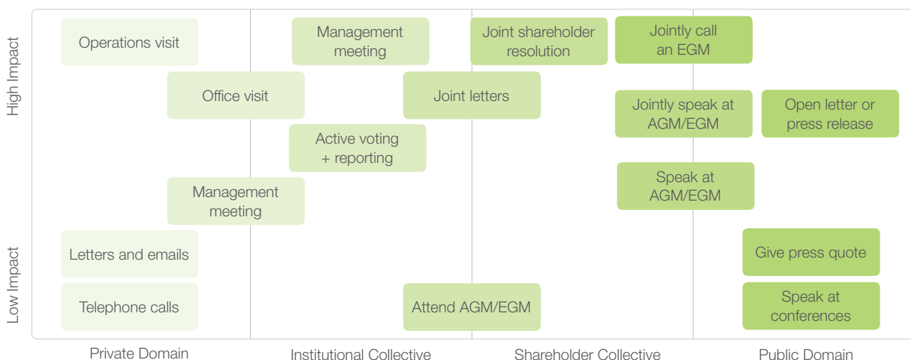
Figure 4. Engagement as a tool for positive change: a variety of instruments. 17

Recent academic research shows that successful engagement dialogue is not only correlated with positive returns on assets, but it also increases communication, learning and internal relationships for investors and companies. 15 In 2012, Ceres, a sustainable business and investor network, found that 50% of the resolutions resulted in commitments to action from the subject companies and more than 75% of those commitments were fully or substantially fulfilled. 16